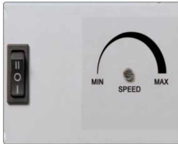
Fan Speed Adjuster