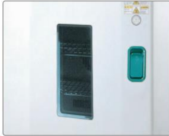
Tempered Viewing Windows