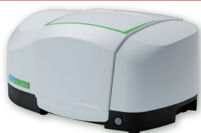
PerkinElmer Frontier and Spectrum Two FT-IR, NIR and FIR Spectroscopy