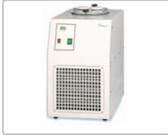
Cold Trap Baths