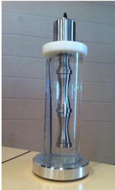
20kHz Radial Probe inserted in a tube